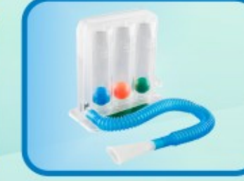
Spirometer / Lung Exercisor