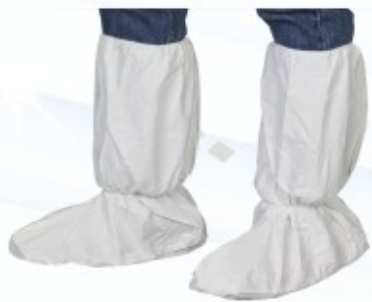
Knee - Leggings Non-Woven