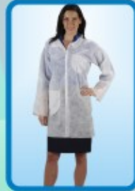
Visitors Coat/Lab Coat