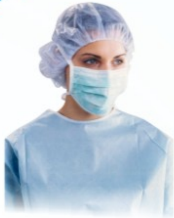
Face Mask / Bouffant Cap

Export Quality Products EN ISO 9001:2008 CE Certified WHO-GMP