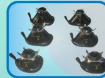
Black Rubber Mask