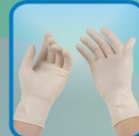
Surgical Rubber Gloves