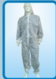
Full Body Suit