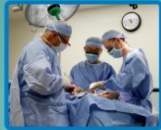
Personal Protection Kit Swine Flu Kit