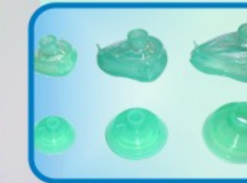
Silicon Face Mask