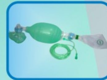
Silicon Ambu Bag