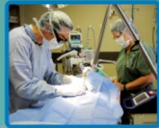
Surgeon Kit Surgical Drape