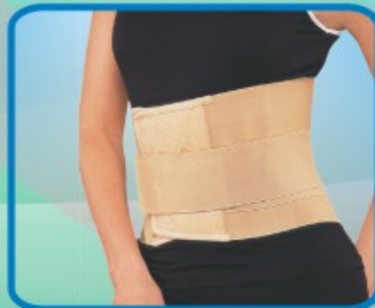
Sacro Lumber Belt