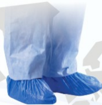
Shoe Cover Plastic / Non-Woven